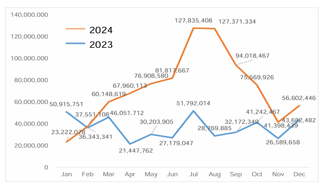
Figure 1: Comparison of cyber threat statistics between 2023 and 2024

1. Comprehensive status of China's cyber threats against Taiwan: According to the Indicators of Compromise from Taiwan's Government Service Network (GSN), the GSN received a daily average of 2.4 million cyberattacks in 2024, doubling the daily average of 1.2 million attacks in 2023 (as shown in Figure 1). In addition, most of the attacks are attributed to the PRC cyber force. Although many of them have been effectively detected and blocked, the growing numbers of attacks pinpoint the increasingly severe nature of China's hacking activities against Taiwan.